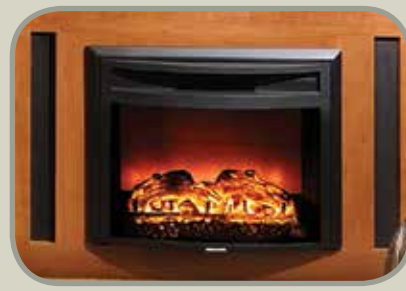
Enjoy the warmth and comfort of the electric fireplace. (Per floorplan)