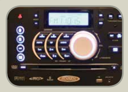
Jensen AM/FM CD/DVD stereo comes standard in the Sandpiper.