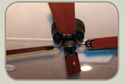
Contemporary ceiling fan.