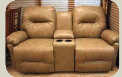
Theater seating with footrests and console (Per floorplan).