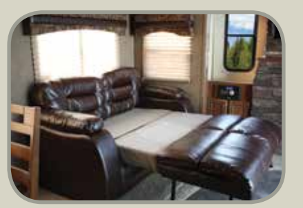
The tri-fold hide-a-bed offers more sleeping options. (Standard per floorplan)