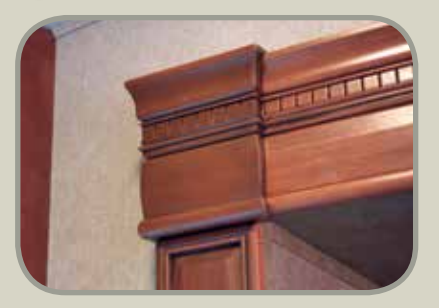
Handcrafted fascia gives the slide-out a distinguished look. Serta™ memory foam mattress is a Forest River exclusive feature.