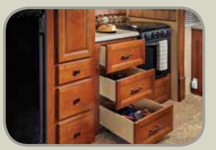
Real wood drawers on ball bearing drawer glides for plenty of storage.