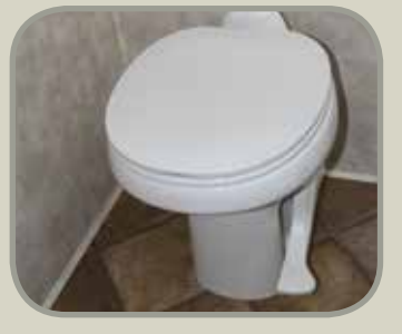
Porcelain foot flush toilet, easy to use, easy to clean.