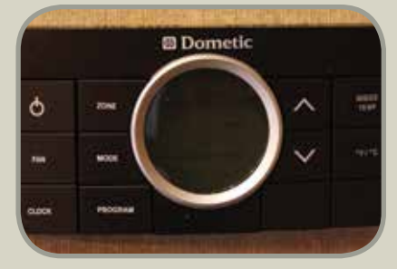
Control the temperature with the dual zone Dometic thermostat.