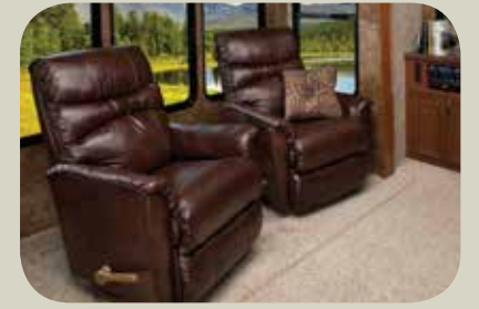
Relax in comfort in a La-Z-Boy. (Standard per floorplan).