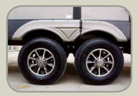
Contemporary aluminum rims with E-rated radial tires.