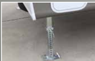
Wide stance power front jacks with quick release snap pins. (5th's)