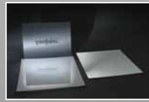
Gel coat fiberglass protects from UV rays and prevents yellowing and cracking.