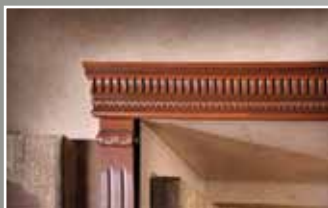
Handcrafted fascia gives the slide-out a distinguished look.