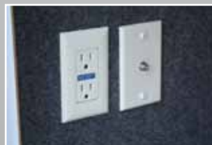
110v outlet and cable outlet conveniently located in the pass thru storage area.