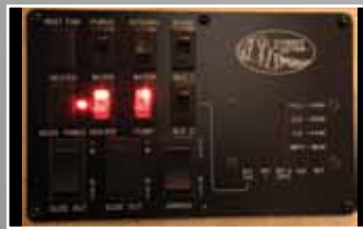
Sandpiper's command center allows you to monitor tanks and other systems quickly and easily.