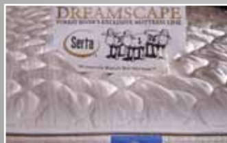
Serta™ Dreamscape mattress is a Forest River exclusive feature.