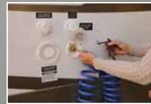
2 quick connect spray ports (one on each side) are great for easy clean up.