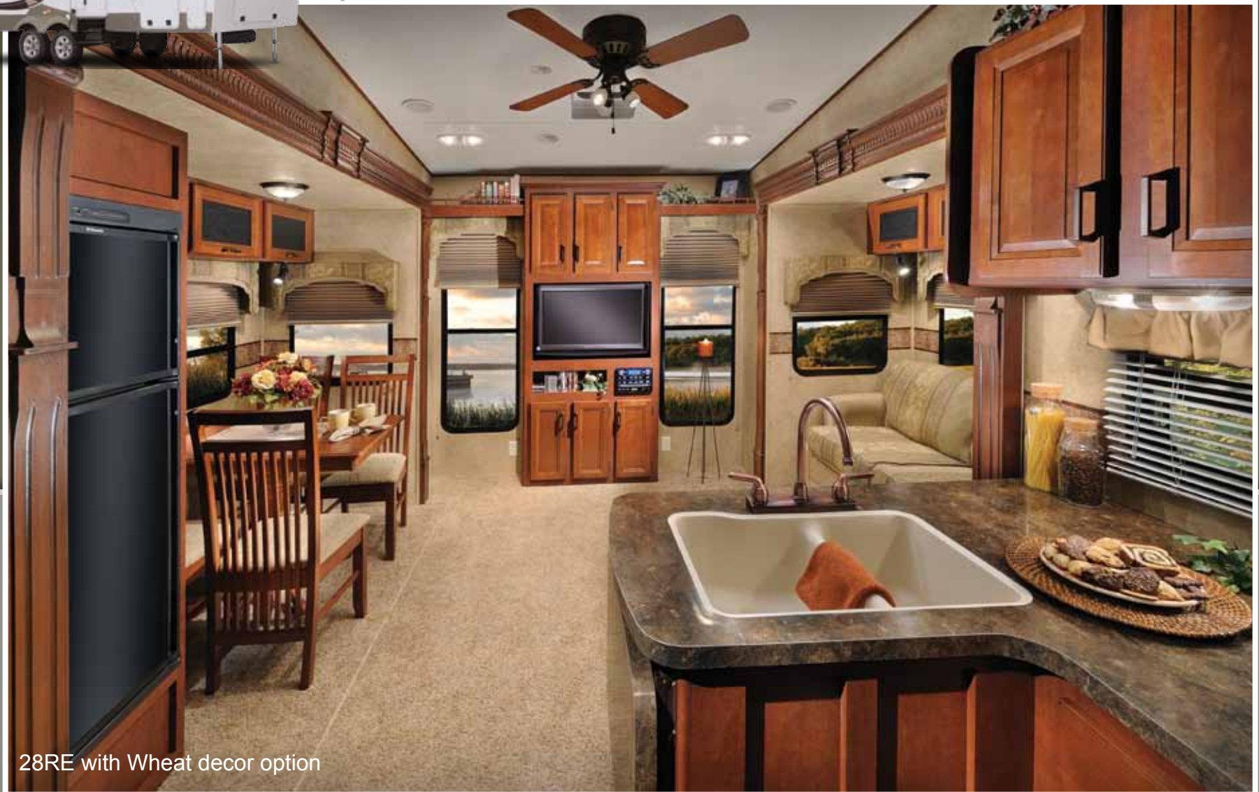
28RE with Wheat decor option

Looking for a light weight and affordable fifth wheel? Look no further, the Sandpiper Select fifth wheel has everything you are looking for. With great features like a 32" LCD/HD TV, under mount sink with high rise faucet and tons of storage, the Sandpiper Select fifth wheel is perfect for both long and short term stays. With the Sandpiper Select line-up of travel trailers and fifth wheels you are sure to find a model that suits your tastes and needs.