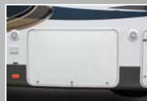
Flush mount exterior speakers for your listening pleasure.