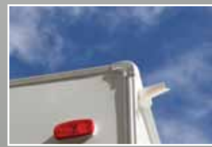
Drip rail with extra long drip spouts that help prevent black streaking.