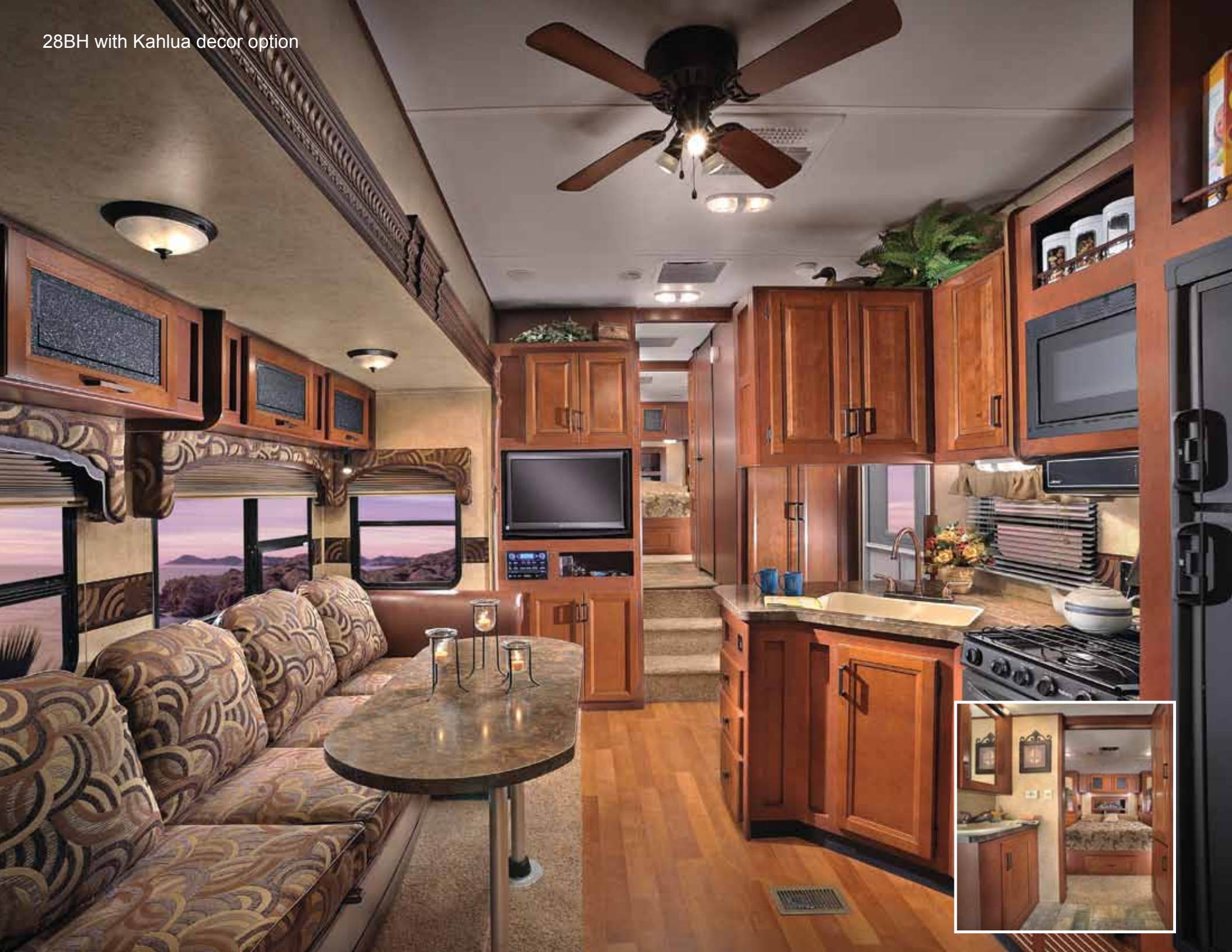
28BH with Kahlua decor option