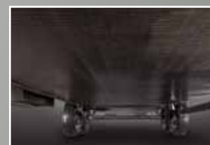
Heated and enclosed underbelly protects your coach and improved airflow allows for a sturdier ride.